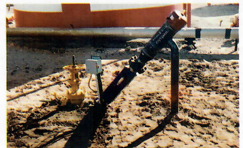
Operator installed a 4" Kinetic Cell.