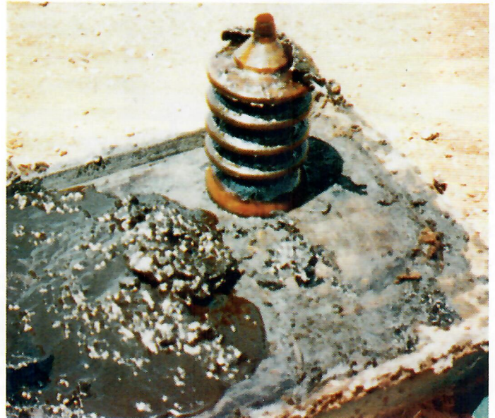
Results after four weeks with Kinetic Cell in service. Kinetic Cell has been in service for over three years.

U.S. Patent No. 4326954/Canadian Patent No. 1164929/Other Patents Pending