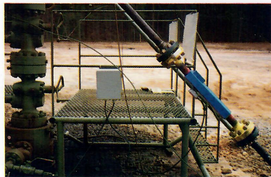
Flowing well in N. Louisiana, 5000 psi at surface, paraffin formed due to pressure & temperature drop. Installed 2" Kinetic cell, care is 2" N80 pup joint. Eliminated chemicals and paraffin in facilities, and 1.4-mile flow line to tank battery.