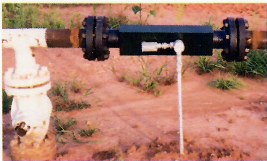
4" Kinetic Cell installed in 4" x 11-mile pipeline, operator eliminated chemicals, disposal of paraffin and reduced paraffin to 1/4 gallon and one pig run per week.