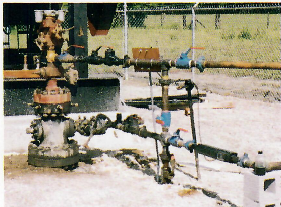
Pumping well in S. Louisiana, 2" tubing, paraffin at 500' daily. Chemical treatment plus hot oil once a month. Installed a Kinetic Cell and eliminated all treatments. In service for nine months.