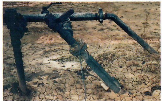
Pumping well in N. Louisiana, 2" tubing, paraffin formed at 500'. Daily chemical treatment, and hot oil once a week. Installed 2" Kinetic Cell at surface, eliminated chemicals, and hot oil once a month. In service for one year.