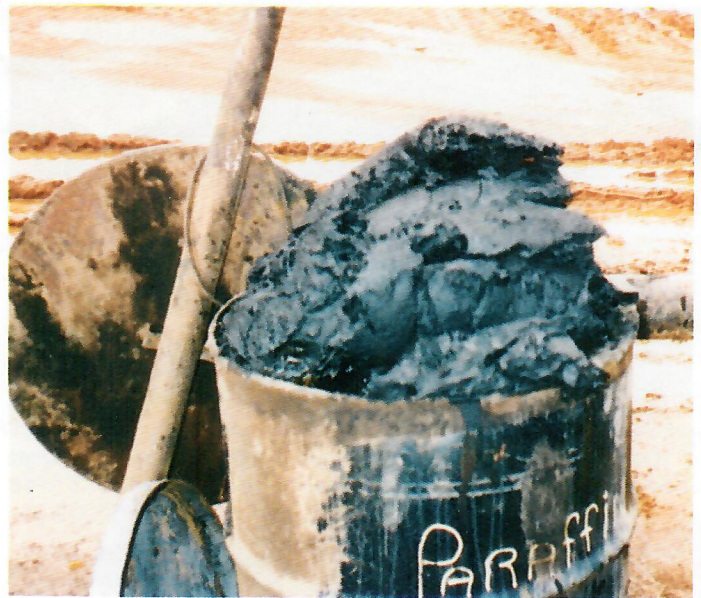
Operator was pigging a 4" 4-mile pipeline three times per week, getting a bbl to a bbl 1/2 of hard paraffin, which had to be disposed.

International marketing to nearly every country.