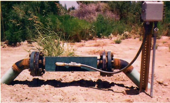
4" Kinetic Cell installed on a 4.7-mile pipeline, operator eliminated chemicals, disposal and maintenance, and reduced paraffin to a trace.