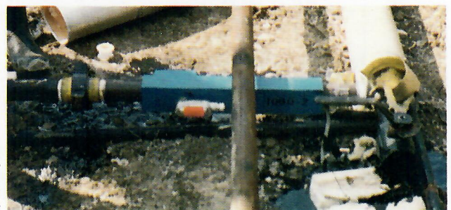
Pumping well in S. Louisiana, 2" tubing, continues paraffin solvent daily, plus hot oil every two weeks, paraffin formed a 900' down hole. Installed 2" Kinetic Cell at surface, eliminated chemicals and hot oil to once a month. In service for 18 months.