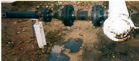
2" Kinetic Cell in 7-mile pipeline, operator eliminated chemicals and reduced pig runs and paraffin to a trace. In service for one year.